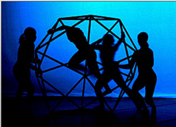
Louder Than Words Dancers.

Contact: 720-231-7142, info@louderthanwordsdance.com , www.louderthanwordsdance.com .