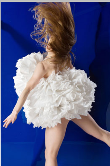
Ormao dancer Gwen Phillips.

Tickets: $15. Contact: 719-471-9759, ormao@msn.com , www.ormaodance.com .