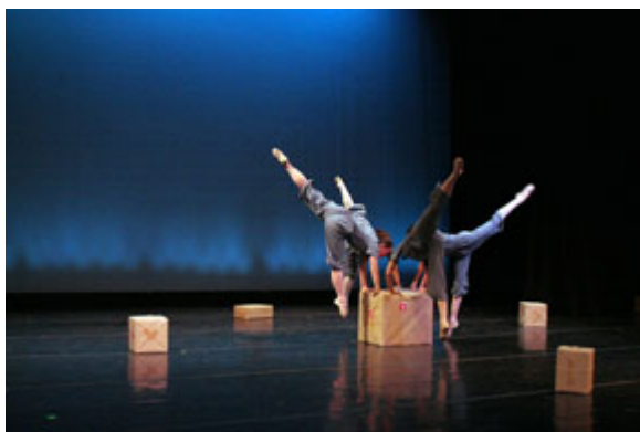
Arvada Center Dancers in performance.

The Arvada Center for the Arts Dance Program , 6901 Wadsworth Blvd, will hold their Ballet IV/V Dance Camp FOR AGES 12-17, 1:00-4:00 pm during the above dates. In addition to ballet and pointe technique, dancers learn parts of famous Balanchine ballets; some new techniques for mastering turns; pilates-based conditioning for flexibility and core strength; and how to apply stage makeup for theaters of all sizes. Tuition cost is $100. This camp is for intermediate to advanced dancers with four or more years of training. Students are asked to bring 2-3 pieces of music to the first class for inspiration. Contact: www.arvadacenter.org .