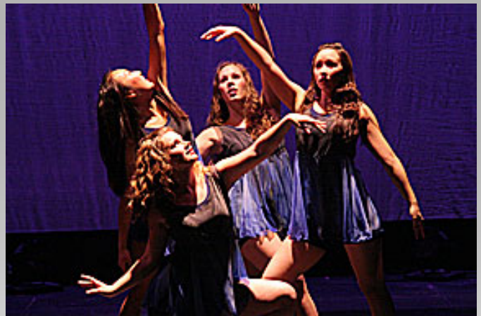
Arvada Center Dancers.

Contact: The Arvada Center box office, 720-898-7200, www.arvadacenter.org .