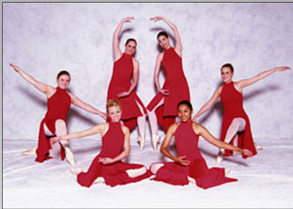
Aurora Dance Arts advanced dancers.

Contact: 303-326-8308, rsommers@auroragov.org , www.auroragov.org/arts .