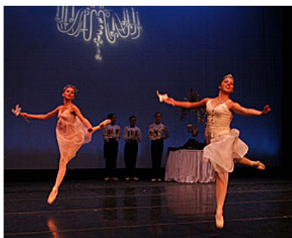
Arvada Center dancers.

Arvada Center of Arts Dance Program , 6901 Wadsworth Blvd, will offer their Dance Theater Boot Camp FOR AGES 12-17. This class is open to dancers level IV & V in Jazz or level IV, V & VI in Ballet. Camp includes ballet and jazz techniques as well as many styles that company dancers must be adept in. Students will learn how to carry themselves, how to dress and what to expect at an audition. Camp is strongly recommended for dancers who are