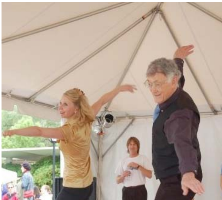
Photo: Watch Your Step! Vintage Dance Vignettes will kick off the activities on Sunday, November 22 with a variety of vintage dances in wonderful costumes.